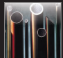
PIPE & TUBE