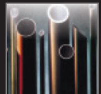
PIPE & TUBE