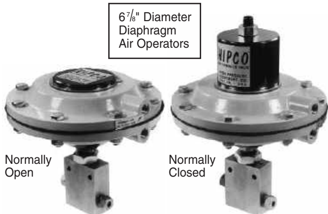
6 7/8" Diameter Diaphragm Air Operators

Considerations . . . Extended stuffing box for temperatures from -423°F to 1,200°F (medium and high pressure connections only)