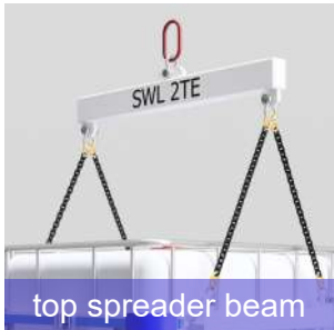
top spreader beam

Modular frame designed for safe movement of IBC containers