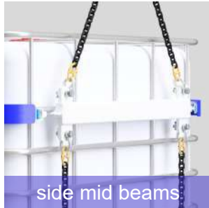
side mid beams