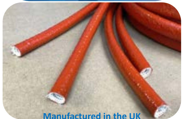
Manufactured in the UK